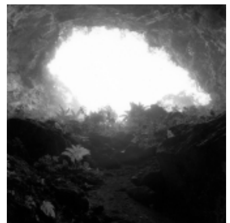
Observatory (Xilitla, Veracruz, Mexico, 2001)