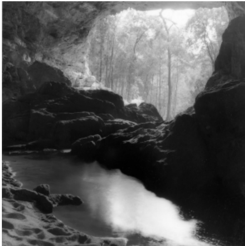
Oasis (Rio Frio Cave, Cayo District, Belize, 1999)