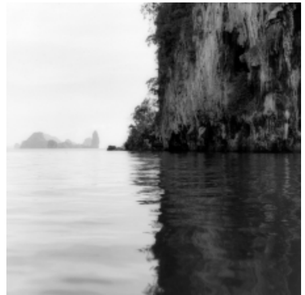
Quadrant (Phang Nga Bay, Thailand, 1999)