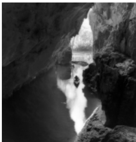
Departure (Barton Creek, Cayo District, Brazil, 1999)