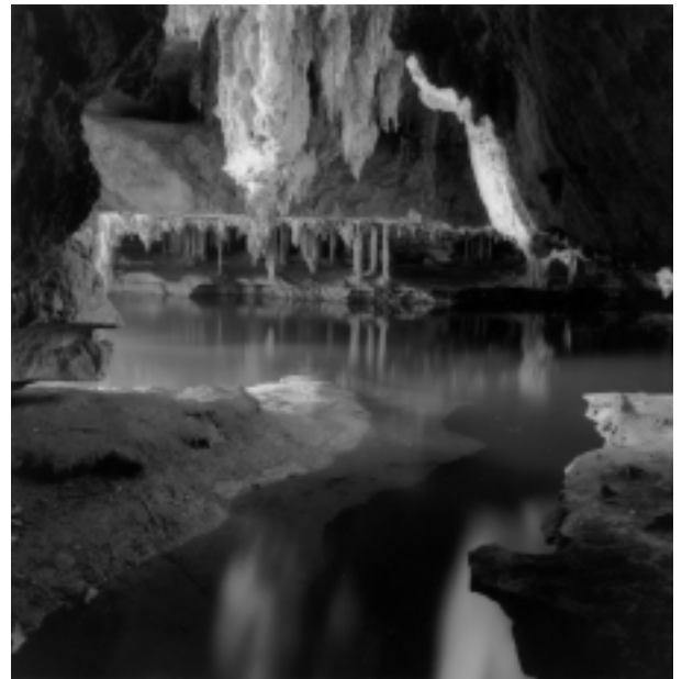
Continental Drift (Krabi Province, Thailand, 2001)

If you are interested in running more than two images, or to obtain high resolution images for reproduction, please contact Umbrage Editions by phone: 212-965-0197 ext. 3# or by e-mail: press@umbragebooks.com . Information about each photograph is available upon request.